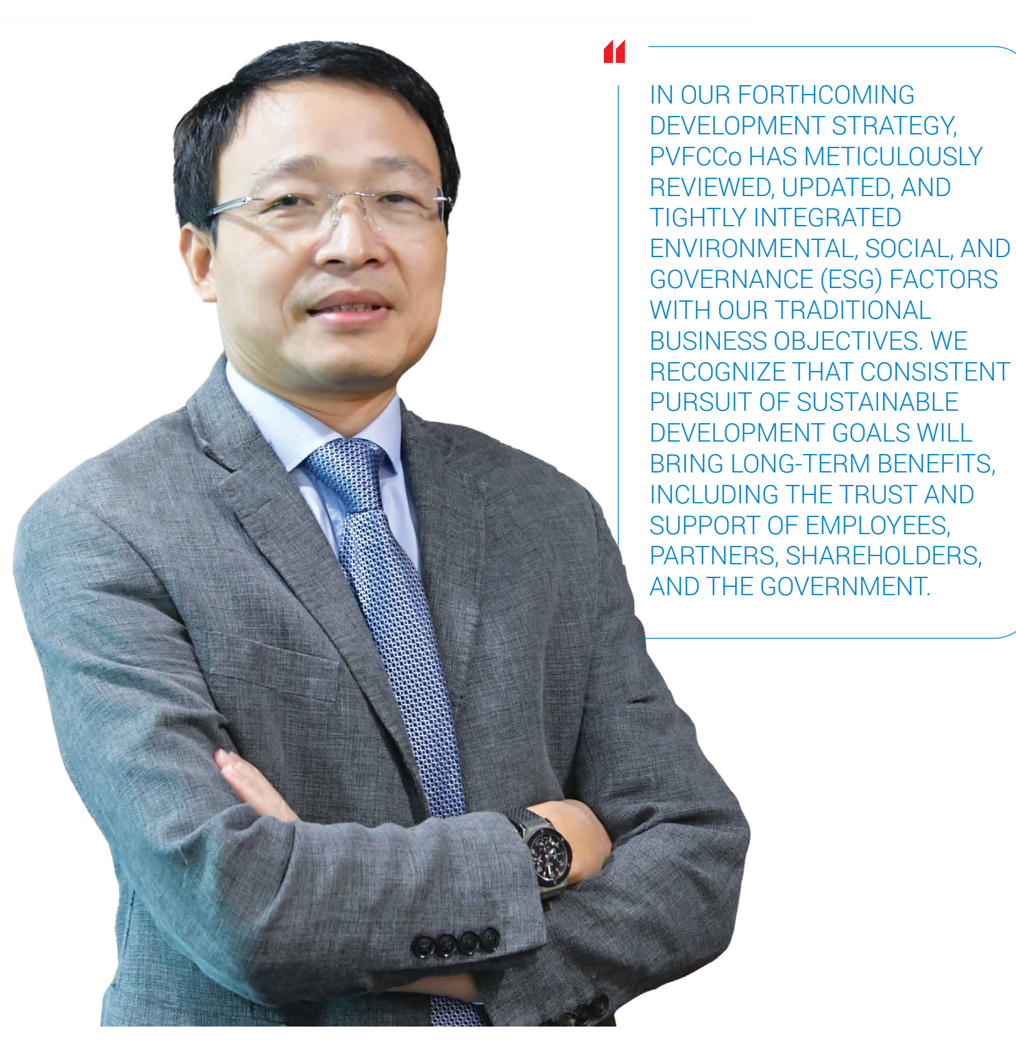
PVFCCo's President and CEO undertakes the highest responsibility for the Corporation's environmental policies/issues.

On 27 March 2023, PVFCCo commemorated its illustrious 20-year journey with numerous milestones and memorable achievements.